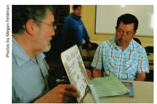
Adult tutors connect with learners using a variety of teaching techniques.

Together with co-coordinator and Neighbors Link