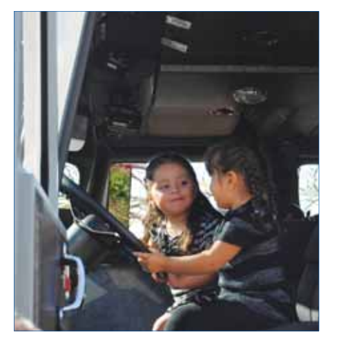
FIRE SAFETY DAY PRESENTED BY THE MOUNT KISCO FIRE DEPARTMENT

WORKER CENTER / 365 days a year Open from 7am-10pm • 7 days a week • Holidays too! Skilled Workers and Day Workers Available