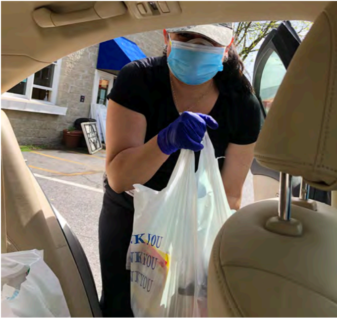
Bags of food are loaded into cars for volunteers to deliver to individuals and families in our community.

The services we have been able to provide during the coronavirus crisis simply would not be possible without the extraordinary efforts of our volunteers. From the beginning of the pandemic, volunteers immediately asked us how they could help. Neighbors Link usually has more than 400 people (including both long-term residents and recent immigrants) volunteering in our programs each year. For the past few months, more than 150 of those volunteers have been delivering food, grocery store gift cards, hot meals, diapers, and other supplies to people who need to isolate. In addition, volunteers have been instrumental in our weekly food distribution, from unloading food, packing food bags (working one family at a time to respect social distancing) and helping manage logistics during the distribution.