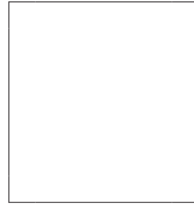
Right index fingerprint of alien removed

(Signature of alien being fingerprinted)